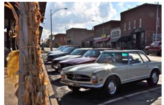
Mercedes-Benz Cars enhance the downtown Louisburg, Kansas area at the November First-Sunday drive.

It was a perfect First-Sunday Drive - except for the game's final score.