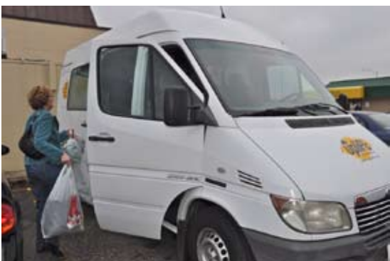
Donations of clothing and other necessities were loaded onto the Uplift truck at the November breakfast.