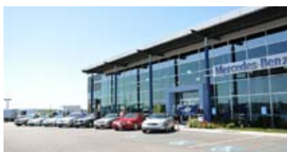
Mercedes-Benz of Kansas City